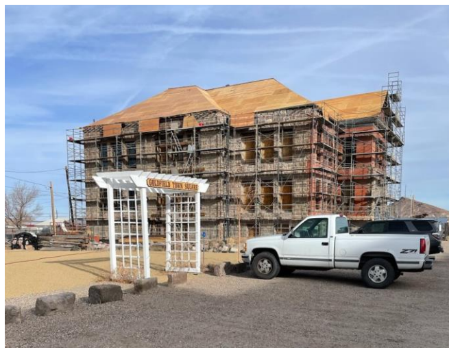
New Plywood Installed