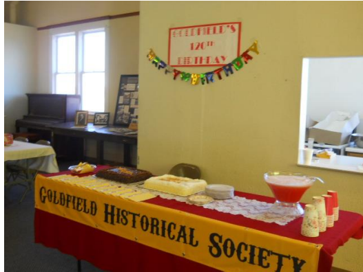
Cake and Punch