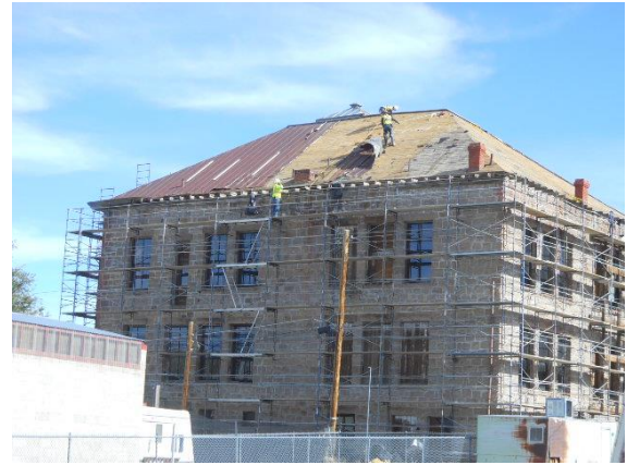
Removing the Old Roof