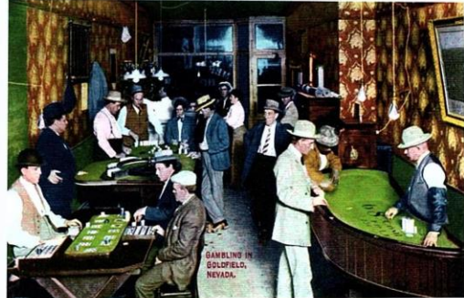
Regina Sublima in gambling room of Merchants Hotel in Goldfield, Nevada. Can you find it? Only top of case is visible, but the Regina Sublima rolls on top confirm identity.