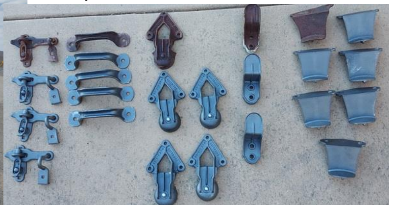
Parts from the Foundry