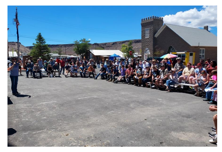
There were quite a few people bidding at the land auction.