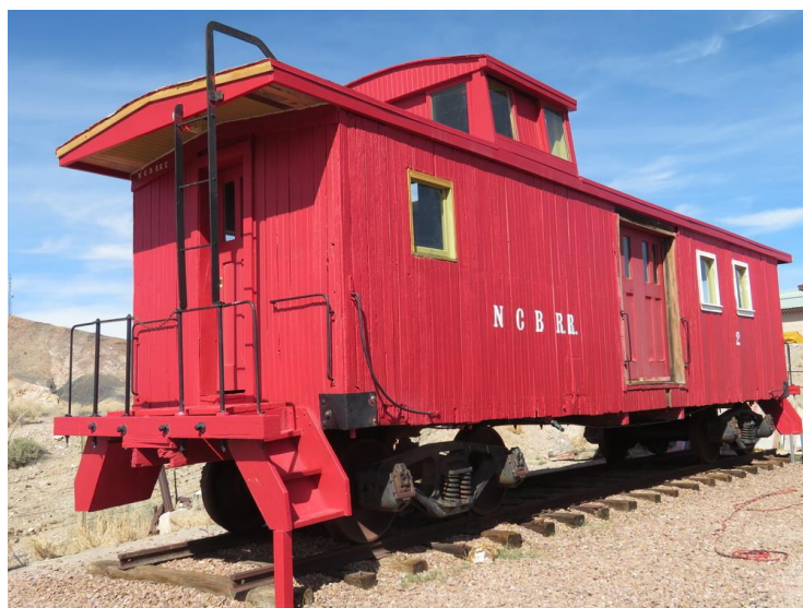
Job complete – 4 X 4's gone.