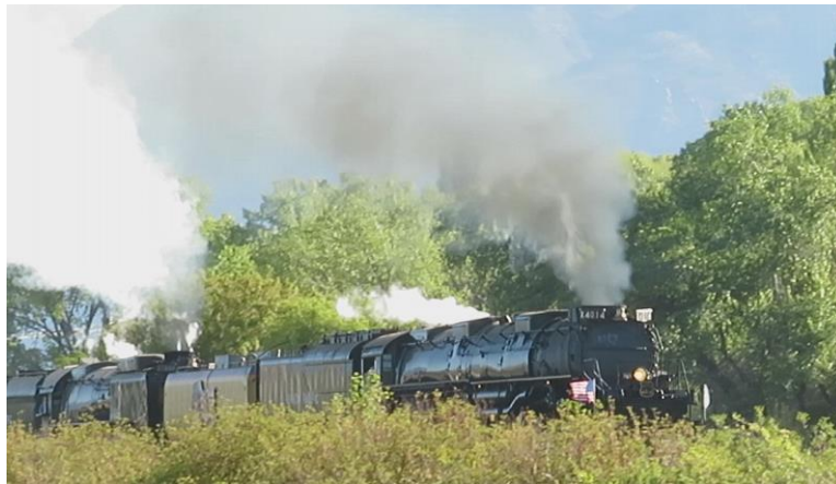
Locomotive 4014 steaming back to Cheyenne on 5/12/2019

For those interested in train events, the centennial of the San Diego & Arizona railway will be celebrated later this year on November 16 th . This line has been labeled the “Impossible Railroad,” and for good reason. It runs from San Diego through 44 miles of Mexico, then through Carriso Gorge and down to El Centro. You can get more details at www.psrn.org/centennial . There’ll be a ground breaking anniversary event on September 7 th and a Golden Spike re-enactment on November 16 th . All events will be held on the grounds of the Pacific Southwest Railroad Museum in Campo, CA.